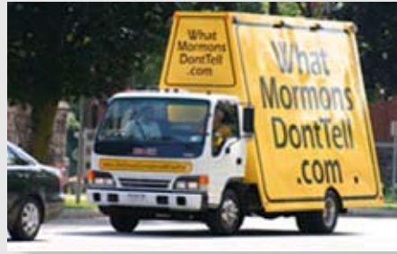
The SignTruck circulated around the village, turning heads during the daylight hours

By 11:00 am—the same morning—Tom called me to tell me a single donor offered to pay what ever we did not currently have for the van purchase. Within only a few hours of telling Tony we would take the van I was able to call him back and