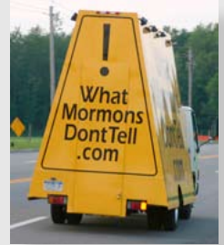
Mormons were calling the SignTruck the "Cheese Truck." Imagine that.

All during the 9 days of the Pageant outreach, we had local Christians and other non-Mormons stopping to encourage us and Mormon and non-Mormon families stopping to