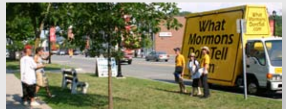
Local teenagers taking photos of CRC Missionaries with SignTruck. Many stopped for photos of themselves with the truck.

take photos of themselves in front of this huge caution-sign-yellow billboard. It was clear that this spectacle was affecting both LDS and non-LDS Pageant visitors and Palmyra residents.